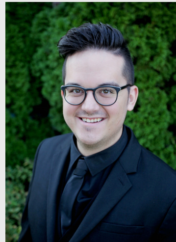
Baker Purdon Music Fellow